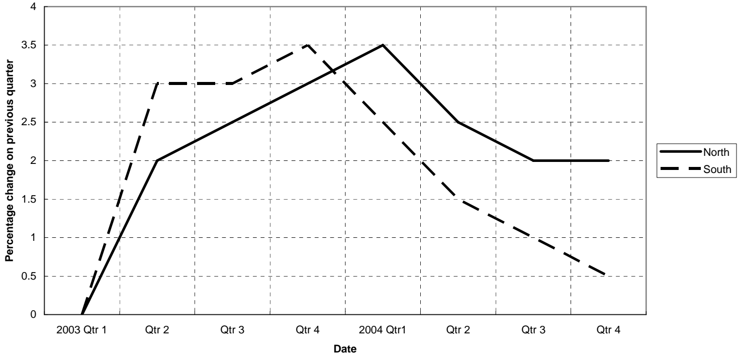
House price changes 2003 - 4